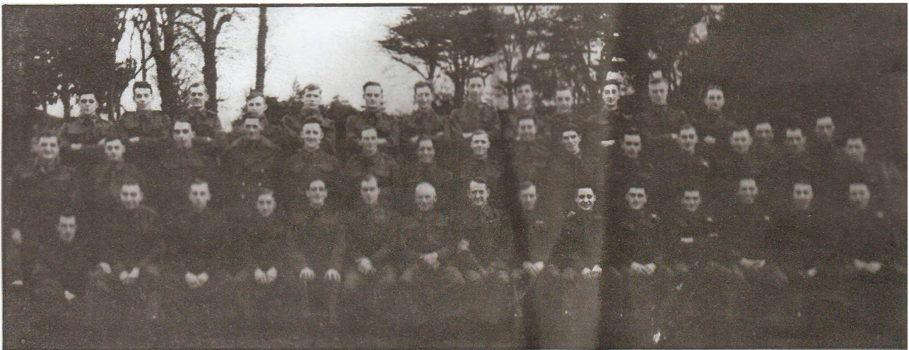
Harthill Home Guard 1939 - 45